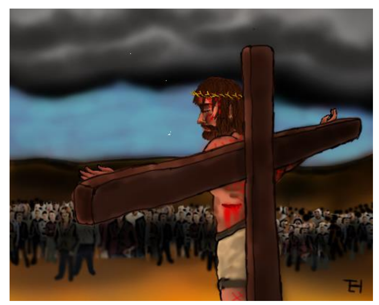
Christ died for sinners!

Roma 6:23 Du i ulê i kimò salà dunan i fati, bay i tadè blé Dwata dunan nawa landè sen fagu di ku Krayst Dyisas, i Amuto.