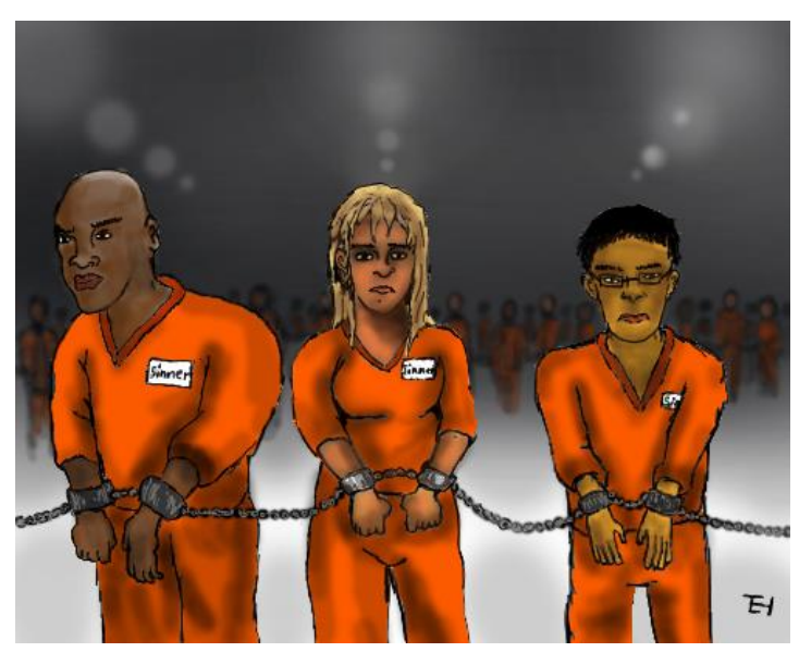
We are all sinners!